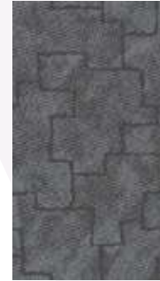
Link In - 773