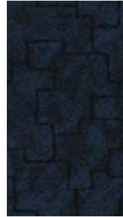
Link In - 755