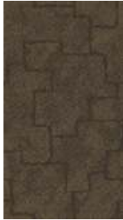
Link In - 745