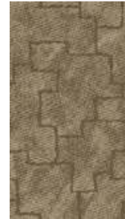
Link In - 795