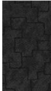
Link In - 778