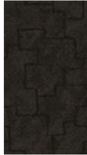
Link In - 749