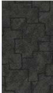
Link In - 776