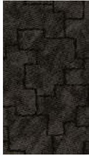
Link In - 748