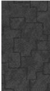
Link In - 775